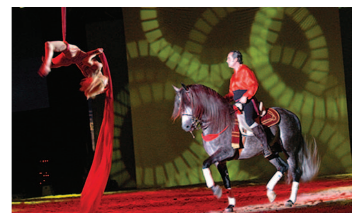
"Performing is a way to express oneself."

"I am the son of a very humble family, and horses have always been an important part of our lives. My parents worked with horse carriages, and I am the only one in the family who dedicated